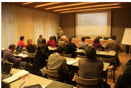
2nd Edition, Madrid 2014 First-level course

For further information, you may contact: comunicacion@spancold.es