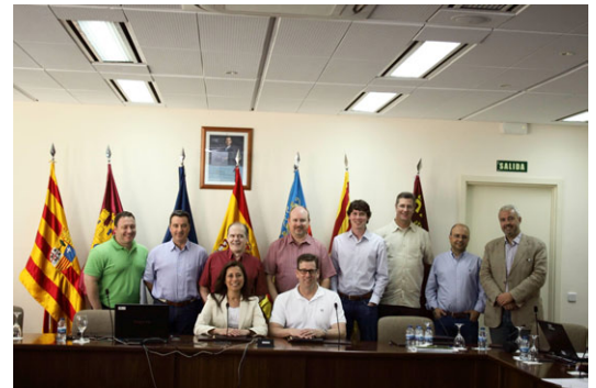
MAGRAMA-USACE Meeting (Valencia, June 2015)

A meeting was held in Valencia in June 2015. The document was signed in August 2015.